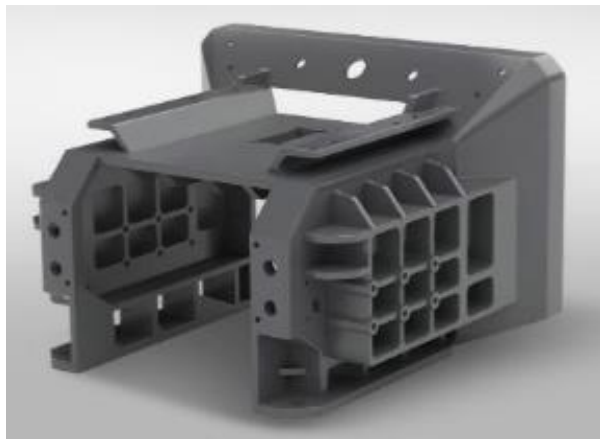
SiSiC structure exhibiting the available design flexibility