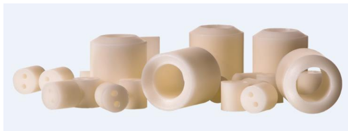
Picture of alumina parts