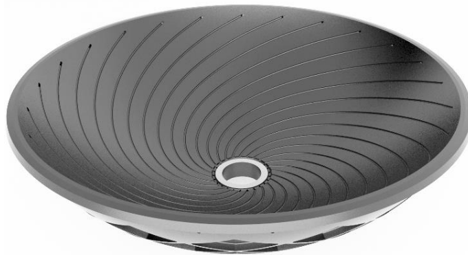
SiSiC fusion joined mirror